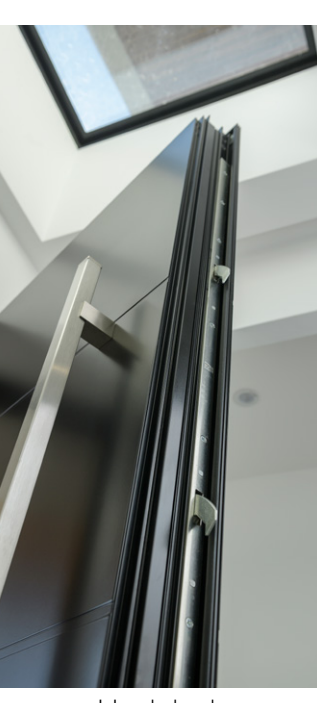
Cylinder with steel guard