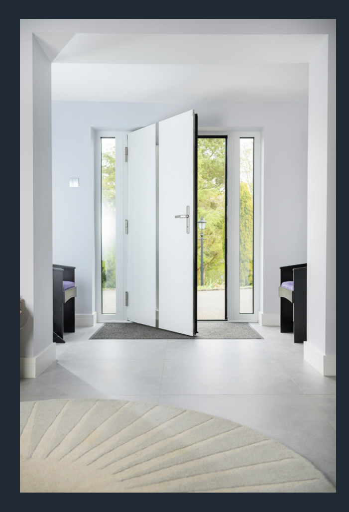
"Simplicity is the ultimate sophistication."

In fact, with such an enormous range to choose from, including doors with sidelights, toplights, double doors and French doors, there's a Spitfire S-200 Series door to suit every kind of property, whatever your personal style and taste in décor.